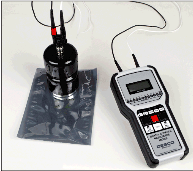
Figure 2. Using the Concentric Ring Probe with the Desco Digital Surface Resistance Meter