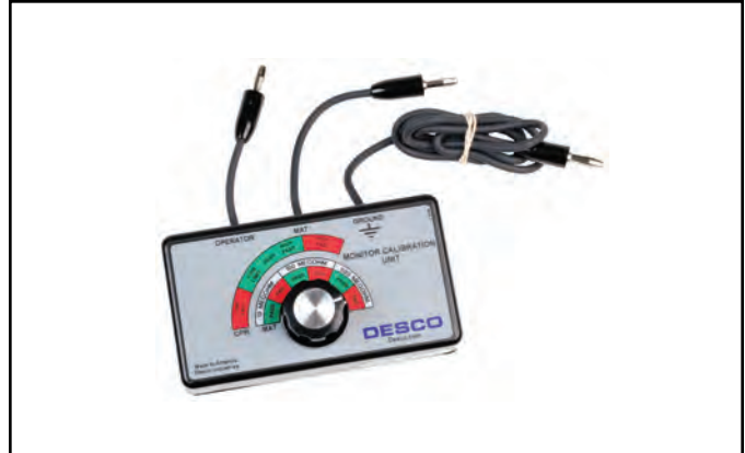
Figure 7. Desco 98220 Single-Wire Monitor Calibration Unit

Because of the impedance sensing nature of the test circuit, special equipment is required for calibration. We recommend that calibration be performed annually, using the Desco 98220 Single-Wire Monitor Calibration Unit. This Calibration Unit is a most important product which allows the customer to perform NIST traceable calibration on Desco single-wire continuous monitors. It is designed to be used on the shop floor at the workstation, virtually eliminating downtime, verifying that the continuous monitor is operating within tolerances.