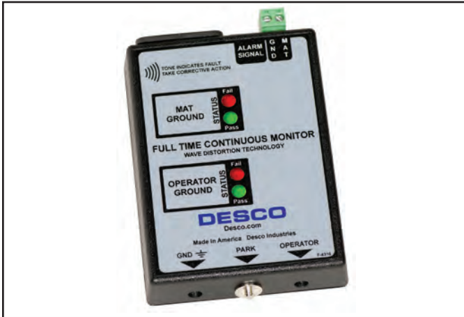
Figure 1. Desco Full-Time Continuous Monitor